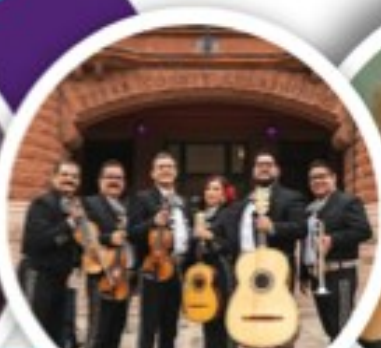
MARIACHI DE AZUL SAN ANTONIO